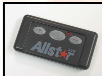
works with these transmitters

Enter ON/RESET, (PIN No), ##, 3, (door code) To operate your door press ON/RESET, (PIN No), *, 3